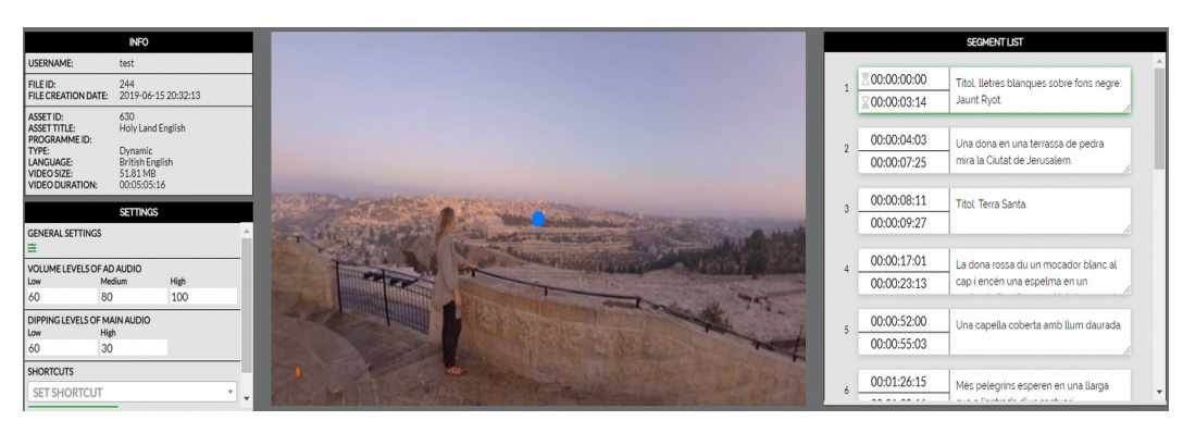
Illustration 4: Informative sections